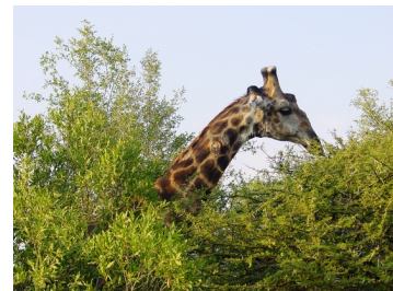
A giraffe helps itself to some very high food, Kruger National Park, South Africa

As it turns out, evolution isn't like this (or, at least, it's almost always not like this, though more about that later), but this is one of the oldest and most common misunderstandings about the evolutionary process. Many of the most prominent scientists for more than a century were convinced that it must be the case that, to describe the problem as they would have, acquired characters are inherited – that is, that characters that organisms develop during their lives (like stretched necks or big biceps) will be passed on to their offspring. Darwin himself even argued that what he called “the effects of use and disuse,” or the ways in which using a part or disusing another part could affect how characters were passed from parents to offspring, was an important factor in cases like the disappearance of eyes from species that live in caves.