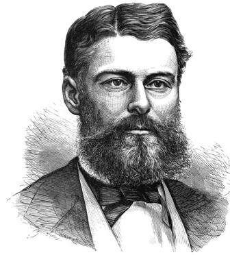
Edward Drinker Cope, in an engraving from 1881 in Popular Science Monthly

In addition to Lamarck, Hyatt mentions two other figures as proponents of neo-Lamarckism, one of whom was Edward Drinker Cope (1840–1897). Cope is an amazing figure, worth studying for lots of reasons. Among other things, he was one of the first major American paleontologists, and a dispute between him and fellow fossil-hunter Othniel Charles Marsh (1831–1899) kicked off a competition to find dinosaur fossils in the American West that became known as the Bone Wars . This radically changed our understanding of the nature and evolution of dinosaurs, and helped to create the contemporary discipline of paleontology.