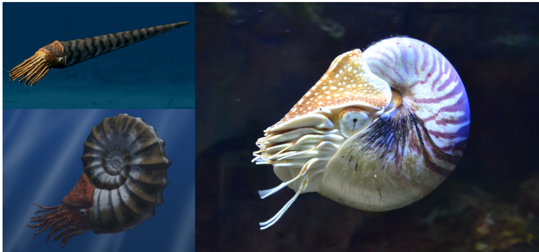
An Orthoceratite (top left), an ammonite ( Asterocheras obtusum , bottom left), and a nautilus ( Nautilus pompilius , right; left two images CC-BY; by Nobu Tamura; right image public domain; all Wikimedia Commons)

The efforts of the Orthoceratite to adapt itself fully to the requirements of a mixed habitat gave the world the Nautiloidea: the efforts of the same type to become completely a littoral crawler developed the Ammonoidea. The successive forms of the Belemnoidea arose in the same way; but here the ground-swimming habitat and complete fitness for that was the object, whereas the Sepioidea represent the highest aims as well as the highest attainments of the Orthoceratites, in their surface-swimming and rapacious forms. 2